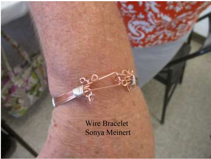
Wire Bracelet Sonya Meinert